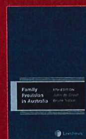
J de Groot & B Nickel 6 th ed LexisNexis 2021 PB $260.00

The second edition of Workplace Bullying explores, in greater depth, the psychological aspect of such bullying and its damaging effects. Workplace Bullying offers advice on how a toxic workplace environment can be prevented from forming. It provides a practical guide to victims of workplace bullying regarding how they can recover and build resilience, and an overview of new legal developments in this evolving area of law