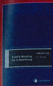
F Assaf SC 3 rd ed LexisNexis 2021 HB $235