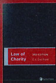
GE dal Pont 3 rd ed LexisNexis 2021 PB $300.00

relating to issuing and setting aside statutory demands, making and opposing winding up applications and includes guidance on the recent labyrinthine amendments made to the Corporations Act by the Corporations Amendment (Corporate Insolvency Reforms) Act, 2020 and temporary amendments made in response to the Covid-19 pandemic. In addition, the book discusses cross-border aspects of winding-up in insolvency and the winding up of Part 5.7 bodies. Complete with precedents, this work is an essential reference text for all legal practitioners.