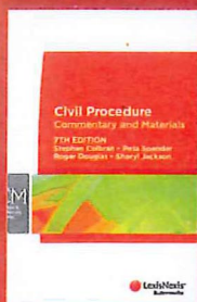
7 th ed LexisNexis Butterworths 2019 PB $159.00